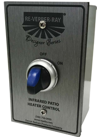
Figure 1 • TH-DSSS1 Controller