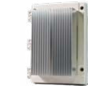
Affinity Dimmer Series