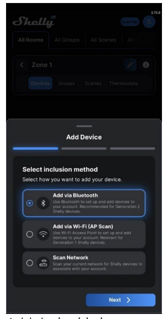
Add device(s) via Bluetooth or Wi-Fi.