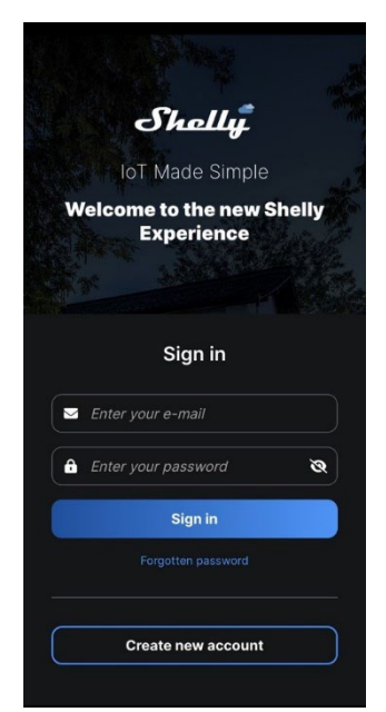
Create a new account and sign in.