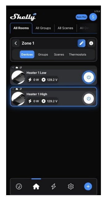
Basic operation – 1 heater: Turn on low fire mode; Turn on high fire mode; Turn off the heater.