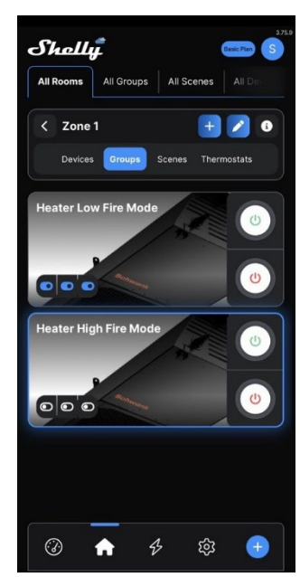
Multiple heaters can be grouped together to be controlled at the same time.